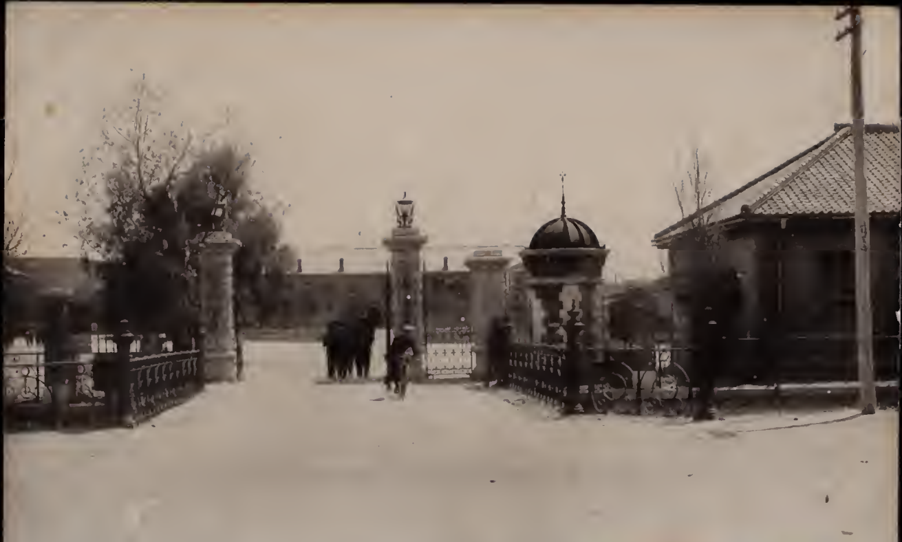
(1687, THE GATE OF THE BARRACK OF THE PUSAN RESIDENT ARMY IN KOREA. 門正營兵山龍軍駐鮮朝(所名鮮朝)